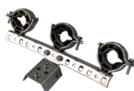
Art. 11-092 MF3 PO G No. LNB holders: 3 Distance between 2 satellites: 6°+20°