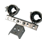
Art. 11-097 MF2 PO G No. LNB holders: 2 Distance between 2 satellites: 6°+11°