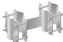
Art. 07-610 CAVALLOTTO 8 CON PIASTRA