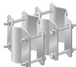
Art. 07-563/A CAVALLOTTO 8 UNIVERSALE

You can combine it with (sold separately):